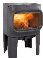
JØTUL F 105 R SL