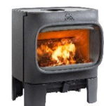
JØTUL F 105 R SL

The object of the declaration described above is in conformity with the relevant Union harmonisation legislation (directive/s and regulations/s):