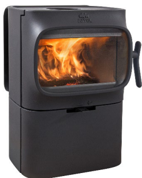
JØTUL F 105 B