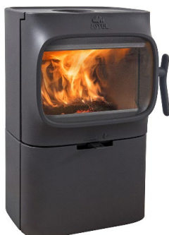
JØTUL F 105 R B