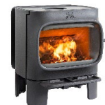
JØTUL F 105 SL