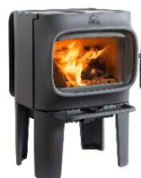
JØTUL F 105 LL