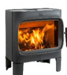
JØTUL F 305 R