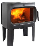
JØTUL F 305 LL