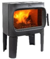
JØTUL F 305 R LL