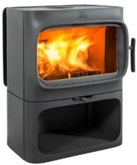
JØTUL F 305 B