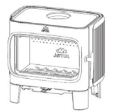
JØTUL F 305 C SL

The object of the declaration described above is in conformity with the relevant Union harmonisation legislation (directive/s and regulations/s):