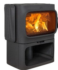
JØTUL F 305 C B