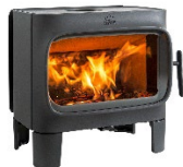
JØTUL F 305 SL