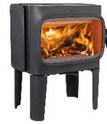
JØTUL F 305 C LL