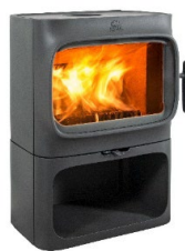
JØTUL F 305